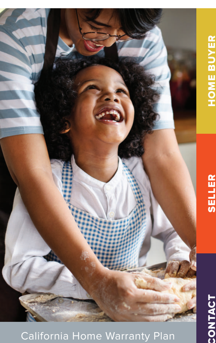
California Home Warranty Plan homewarranty.com 1-800-TO-COVER

Fidelity National Home Warranty helps manage and protect your home expenses with protection plans that cover major systems and appliances. Whether you are a home buyer or home seller, a home warranty is a very affordable way to protect your most valuable asset! It is the type of investment that pays for itself. There is simply no substitute.